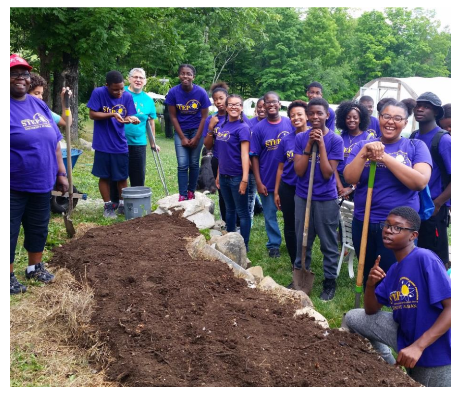
Youth food justice leaders are experts at promoting healthy food in their own communities.

in your farming operations when you make a concerted effort to work with young people. Furthermore, working with young people from lowincome communities can ensure that the next generation is supportive of and actively engaged in local food access efforts, making our collective work for a local food system all the more sustainable in the future. If you plan to recruit young people to help with your operations, we recommend that you explore partnering with local schools or youth organizations which can provide teenagers and adolescents with a stipend, community service credit, or other forms of compensation.