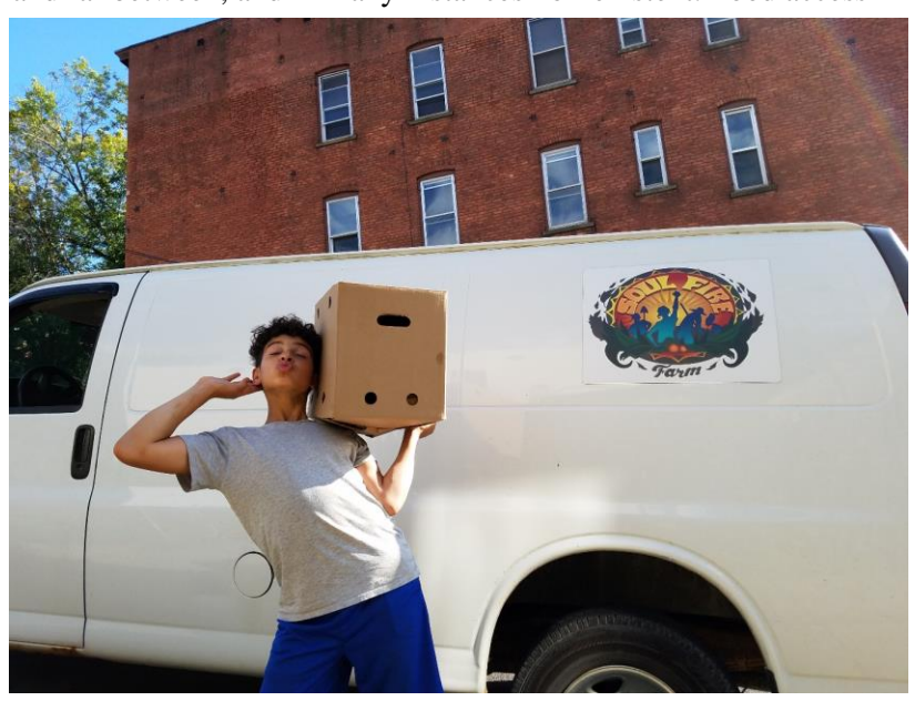
Soul Fire Farm doorstep delivery, dismantling transportation barriers

research has found that "most lowincome households attempt to use cars for food shopping, even though more than half cannot rely on a car that they own."1 These transportation challenges constrain not only poor car-dependent communities in rural and suburban areas, but also denser poor urban communities where personal vehicles are not as prevalent, especially urban communities of color. For instance, "1/3 of all predominantly black census tracts in New York City lack walking or subway access to supermarkets."<sup>2</sup> At the same time, farms and other local food retailers lack the