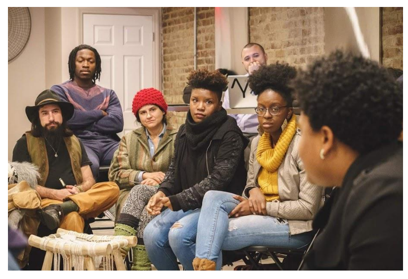
Meeting with community members about healthy food needs.

Finally, social service agencies can help farmers secure external philanthropic and government funding for low-income CSA programs, providing a level of financial stability that many farmer-run food justice initiatives lack. As tax-exempt non-profit organizations often with long-standing histories of working on contracts with local government, social service agencies have access to grants from private foundations and public agencies for which most farmers are ineligible. As partners in CSAs or other local food access initiatives, social service agencies can help farmers tap into these resources, creating a pool of funds to cover outreach, marketing, transportation, logistics, and subsidies to defer the cost of CSA shares. We recommend that you use the online database of organizations on <a href="www.guidestar.org">www.guidestar.org</a> to find non-profits in your area. We also recommend that you connect with your regional food bank and local United Way chapter, both of which are very likely connected to all of the local service agencies focused on food distribution. We further discuss partnerships with social service agencies in the case studies in the next section.