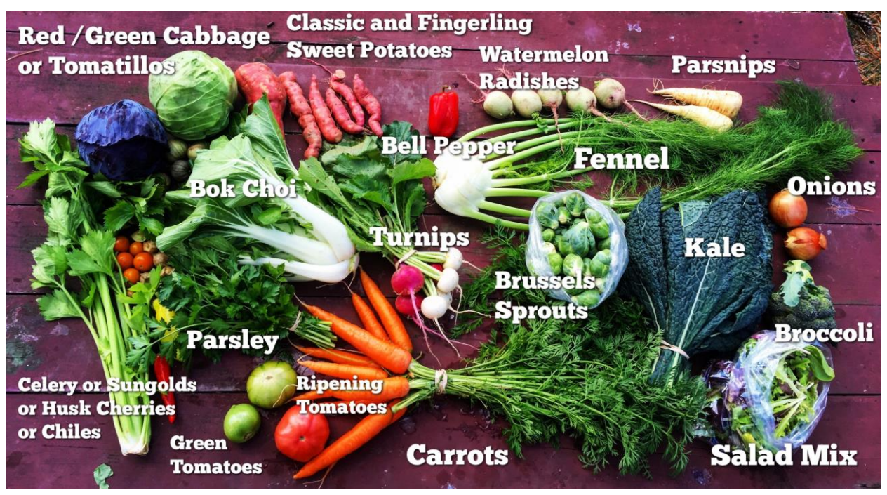
Leveraging government benefits can help insure that ALL people have access to healthy, affordable, culturally appropriate food. This is a typical late summer share for members of Soul Fire Farm's Ujaama program.

It usually takes up to 45 days for applications to be approved. For more details on participating in the SNAP program as a retailer, please reference the <u>Retailer Training Guide</u> with the accompanying <u>video</u> (both can be found in English and Spanish).