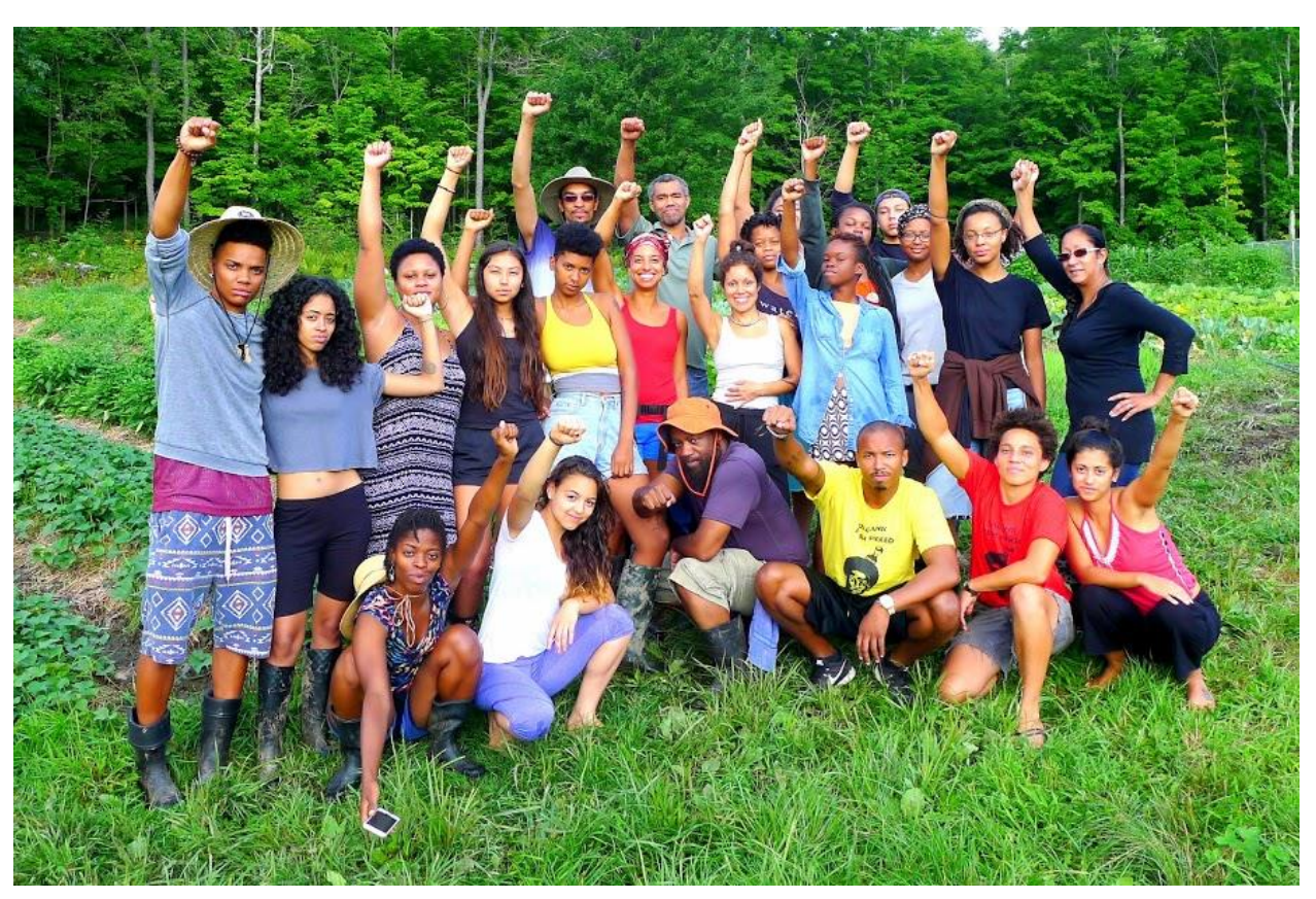
Thank you for being part of the movement for food justice and community self-determination. All of us at Soul Fire Farm appreciate your commitment.