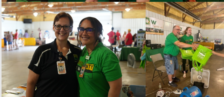
Thank you to JCPH staff who volunteered at the Johnson County Fair!