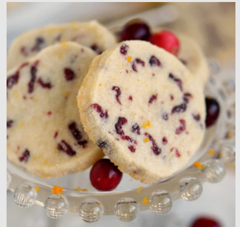
DPM's favorite Cookie Recipe: Orange-Cranberry Shortbread Cookies