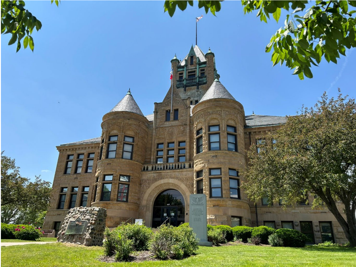
Photo: The Johnson County Courthouse